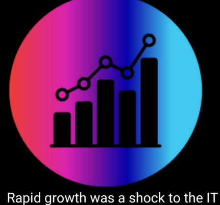
Rapid growth was a shock to the IT infrastructure.

Microstar has experienced extraordinary growth in recent years as craft beer has exploded across America. Growing revenue and headcount by more than 10X while adding significant capacity across various locations. IT Systems & Core Applications became high priority as they were not scaling to meet the needs of the much larger and rapidly growing business.