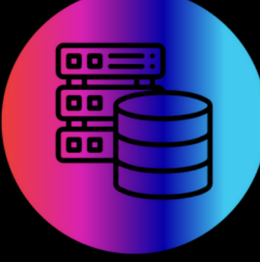
IT Systems were not scaling to keep up with growth.