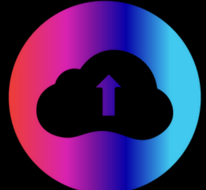
Migrated mission critical applications systems to AWS.