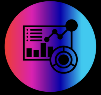
MicroStar wanted to scale efficiently and continue to grow business.