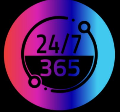
Hired EPLEXITY for 24/7/365 Managed IT Services.