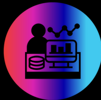
Improved operation efficiencies and enabled on-demand capabilities.