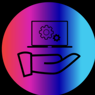
Acquired full SQL control and a highly available infrastructure.